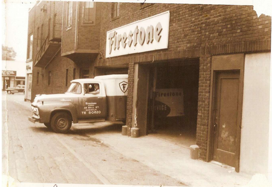
Norwalk, CT closed 1962.