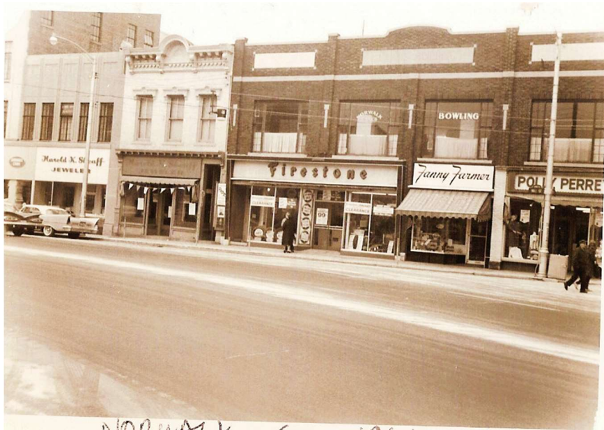
NORWALK, CT 1961 NORWALK 1961