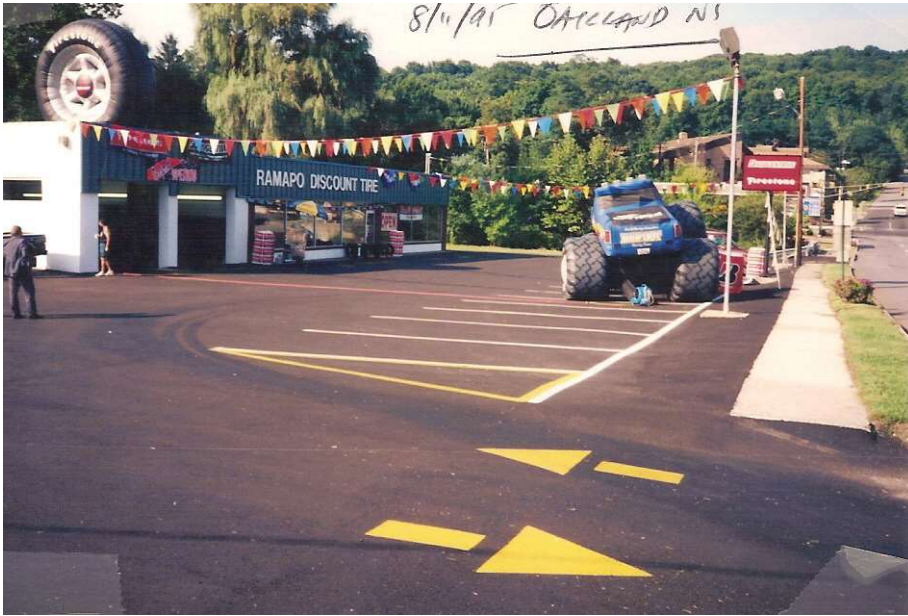
Oakland, NJ dealer