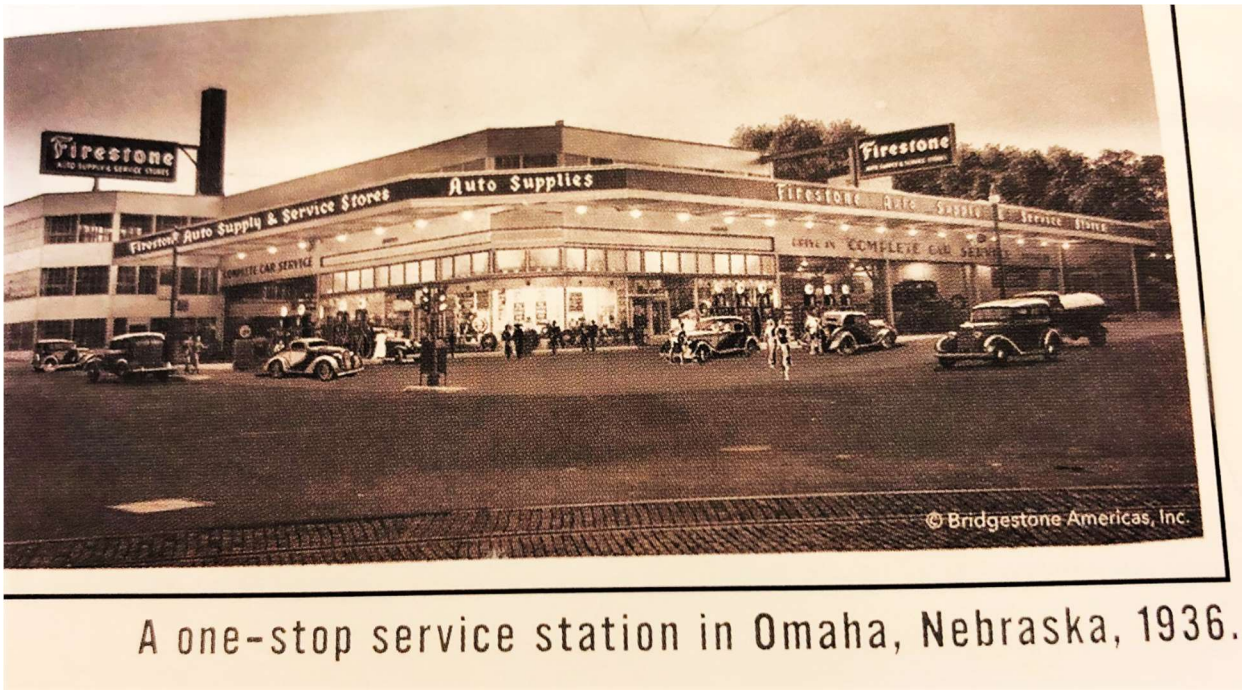
A one-stop service station in Omaha, Nebraska, 1936.